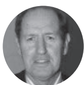
Stewart Gull Football 1985