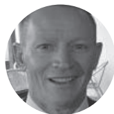
Andrew Wood Triathlon 2008