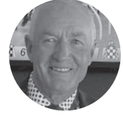
Greg Baker Horse Racing 2022