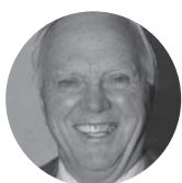
Rex Hollioake Committee 1960