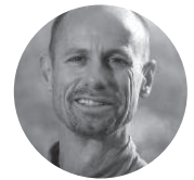
Steve Moneghetti Marathon Running 1990